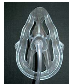
OxyMASK Product # OM-1125-8